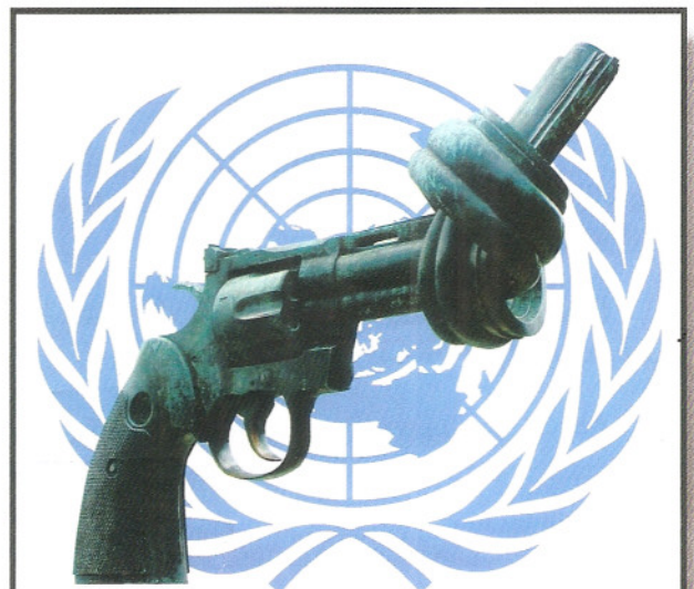
This knotted gun statue at the UN symbolizes the anti-gun radicalism of world government