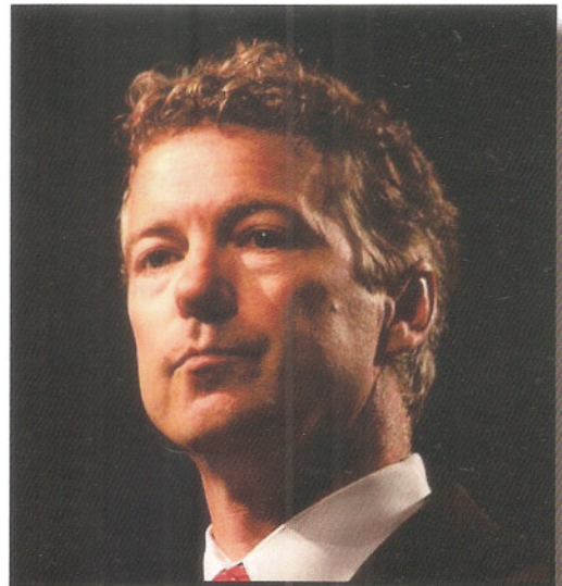
Rand Paul, "The U.S. Constitution is and must remain the supreme law of the land."

P.S. Secretary of State Hillary Clinton has announced the Obama Administration will be working hand-in-glove with the United Nations to pass a new GLOBAL, "UN Small Arms Treaty."